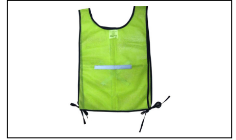
Product Code DVG Unit EACH Description DANGER VEST GREEN REFLECTOR AVAIL. IN: ORANGE