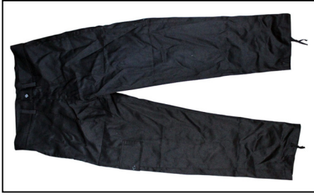
Product Code BRSECT01 Unit EACH Description SECURITY - COMBAT TROUSERS BLACK