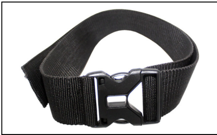
Product Code BRSECWB50 Unit EACH Description SECURITY WEB BELT 50MM