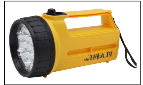
Product Code BRTORF Unit EACH Description TORCH FLASHLIGHT 13 LED 4 CELL