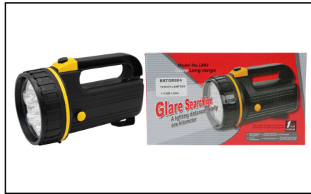
Product Code BRTOR884 Unit EACH Description TORCH LANTERN 13LED L884