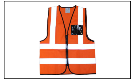
Product Code DVO2 Unit EACH Description DANGER WAIST COAT H/D ORANGE POLYESTER ZIP