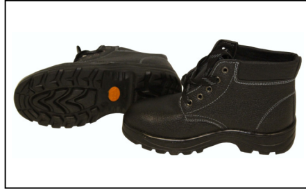
Product Code BRSHUB06 Unit PACK Description SAFETY BOOTS STEEL TOE CAP SIEZ;6,7,8,9,10,11,12