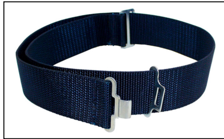
Product Code BRSECWB57 Unit EACH Description SECURITY - WEB BELT QUICK RELEASE 57MM