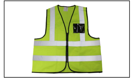
Product Code DVG2 Unit EACH Description DANGER WAIST COAT H/D GREEN POLYESTER ZIP