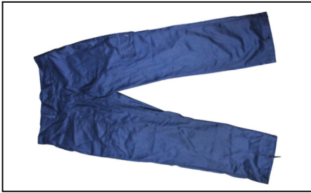
Product Code BRSECT02 Unit EACH Description SECURITY - COMBAT TROUSERS NAVY