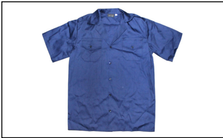
Product Code BRSECS02 Unit EACH Description SECURITY - COMBAT SHIRTS NAVY