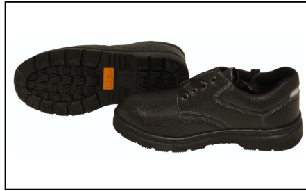
Product Code BRSHUS06 Unit PACK Description SAFETY SHOES STEEL TOE CAP SIEZ;6,7,8,9,10,11,12